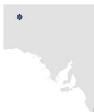
Anangu Pitjantjatjara (AC)